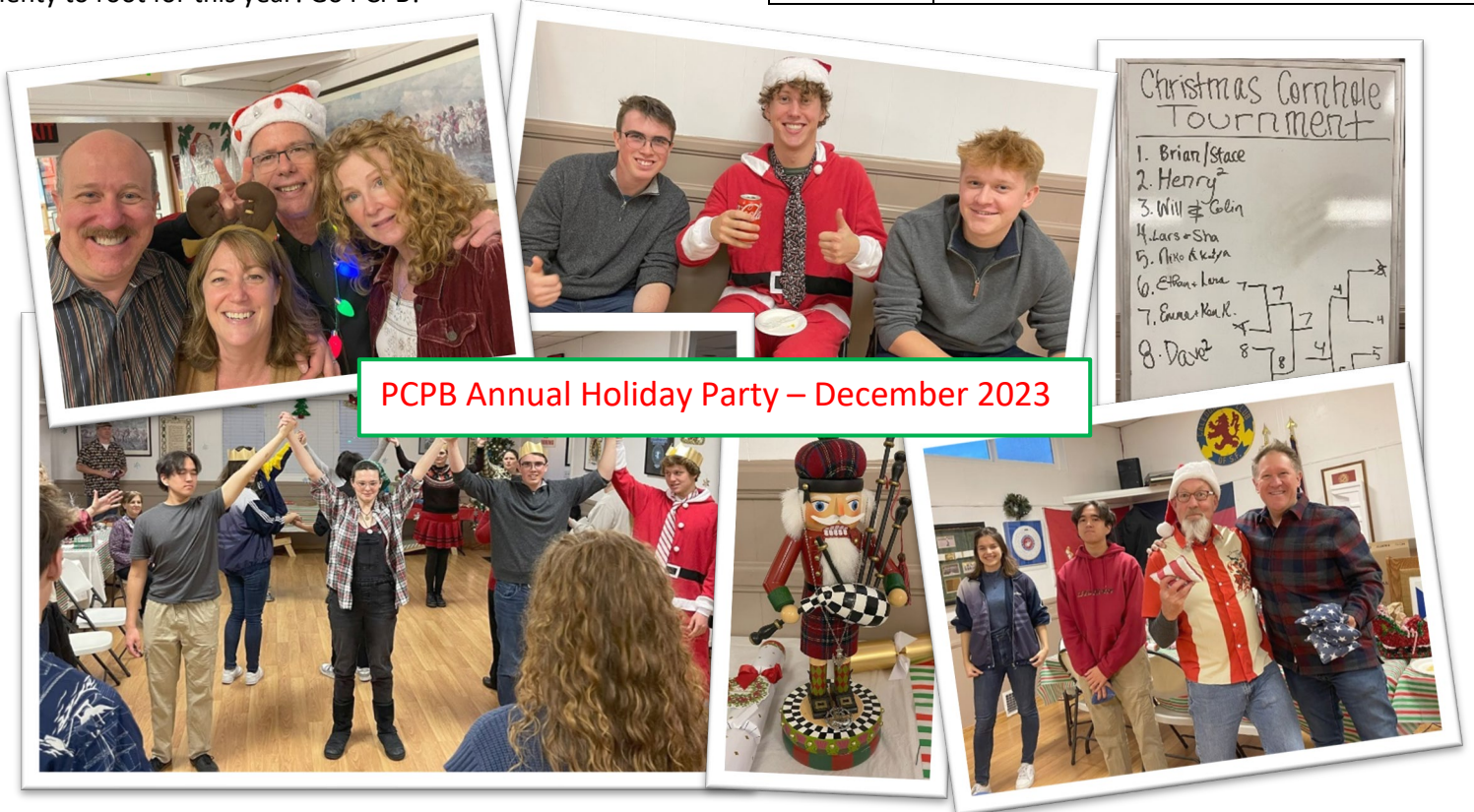
PCPB Annual Holiday Party – December 2023